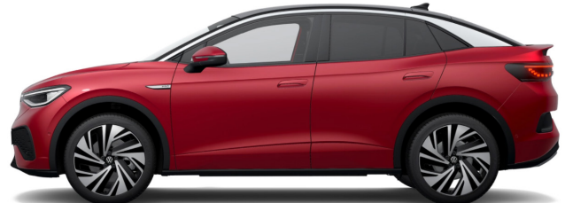
King's Red Metallic 1 P8A1