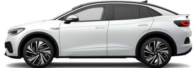
Glacier White Metallic 1 2YA1