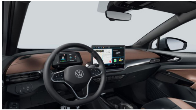
Standard selection from ID.5 PRO PLUS