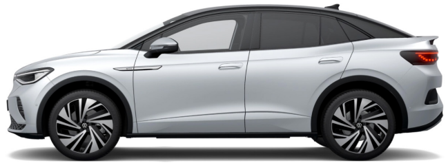
Scale Silver Metallic 1,3 1TA1